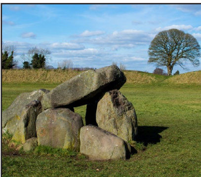
The Giant's Ring