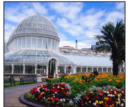
Belfast Botanical Gardens