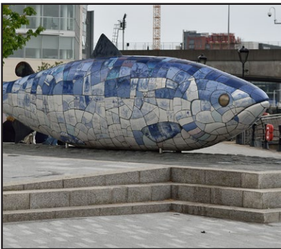
The Big Fish, the Salmon of Knowledge