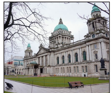
Belfast City Hall