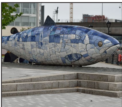
The Big Fish, the Salmon of Knowledge