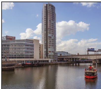
The Obel Tower